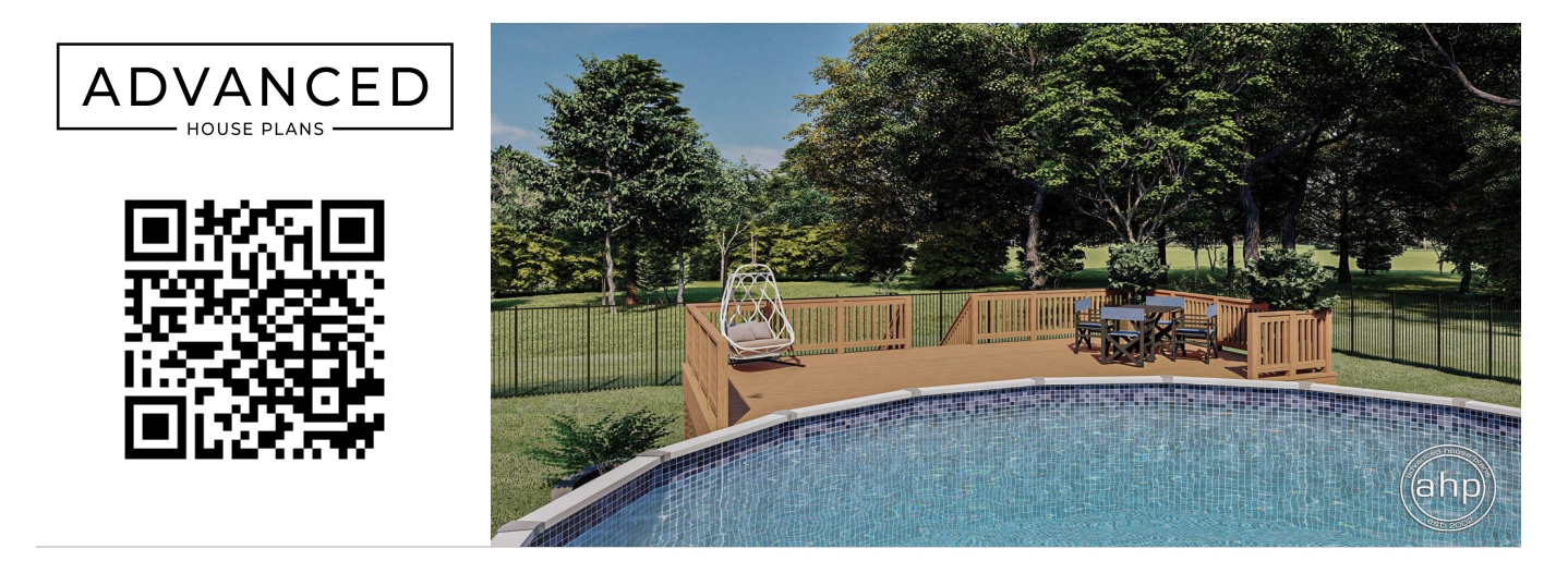
30082 - Misty Bay Data Sheet